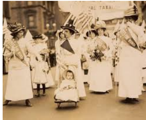
Suffrage Parade in NYC, in 1912

Suffragists gathered to sell pennants and merchandise in Long Beach, New York, in 1912.